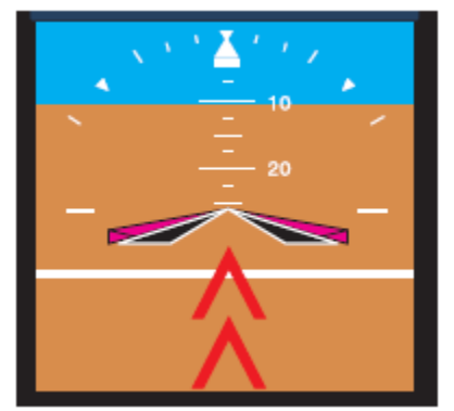
Figure 2. Declutter Display (Tab BB-30)

equal to 25 degrees nose-up, 15 degrees nose-down, and 60 degrees bank angle (Tab BB-30 to BB-31).